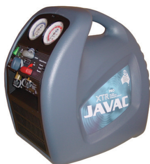
XTRpro Recovery Unit

Refrigerant recovery from refrigeration and air conditioning systems has become very important in the day to day workshop environment. It is imperative and law, that a technician be correctly equipped to deal with refrigerant recovery. The company needs to be compliant and certified to be able to complete such recovery tasks.