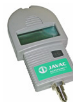
Acravac Digital Vacuum Gauge