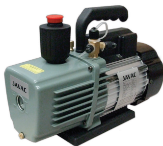
CC81 Vacuum Pump