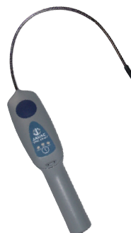
Tek Mate Leak Detector